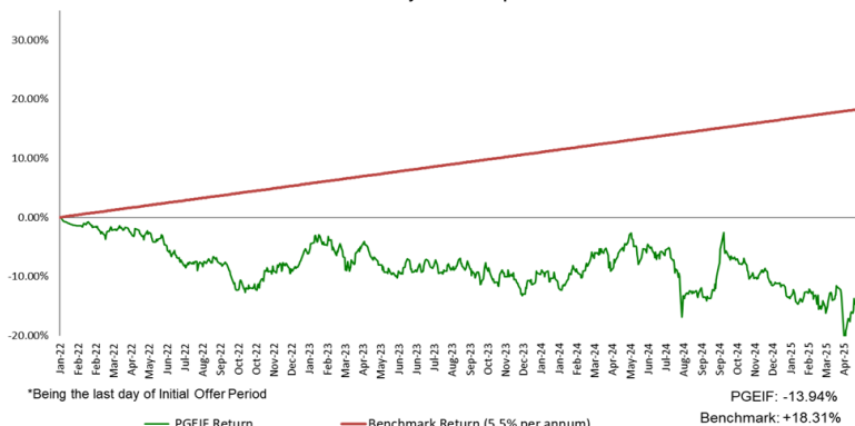
Pheim Global ESG Islamic Fund vs Benchmark Return of 5.5% growth in NAV per annum Movement Chart 05 January 2022* - 30 April 2025

Performance data is calculated on a NAV to NAV basis.