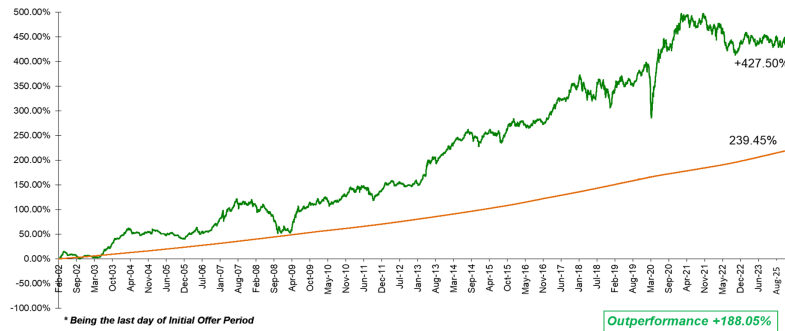
Dana Makmur Pheim vs Maybank 1-year General Investment Account-i (GIA) Rate at the Beginning of the Year +2.00% Movement Chart 17 February 2002* to 31 August 2025

Performance data is calculated on a NAV to NAV basis.