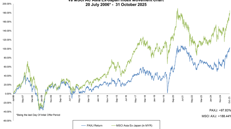
Pheim Asia Ex-Japan Fund vs MSCI AC Asia Ex-Japan Index Movement Chart 20 July 2006* - 31 October 2025

Performance data is calculated on a NAV to NAV basis.