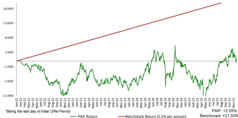
Pheim ASEAN Islamic Fund vs Benchmark Return of 5.5% growth in NAV per annum Movement Chart 05 January 2022* - 30 November 2025

Performance data is calculated on a NAV to NAV basis.