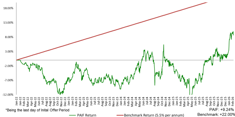
Pheim ASEAN Islamic Fund vs Benchmark Return of 5.5% growth in NAV per annum Movement Chart 05 January 2022* - 28 February 2026

Performance data is calculated on a NAV to NAV basis.